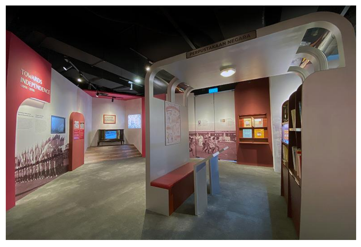
Building a Nation: Singapore became self-governing in 1959. This exhibition zone showcases the role of education in developing Singapore as a young nation.