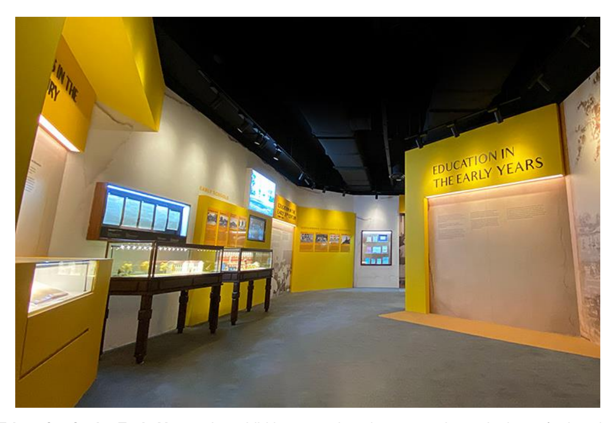
Education in the Early Years: An exhibition zone that showcases the early days of education in Singapore from the 19th to mid-20th century.