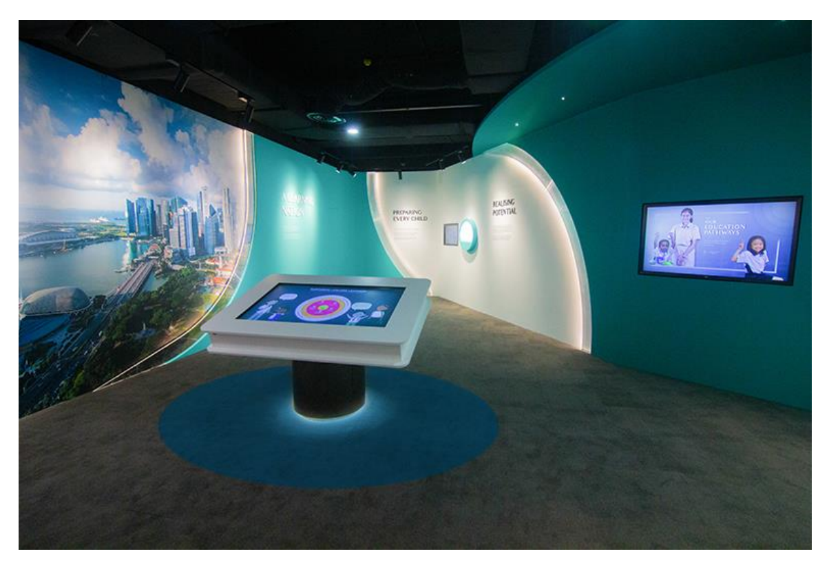
A Learning Nation: This exhibition zone depicts how the education system, schools, and students' learning have evolved as we progress into the 21<sup>st</sup> century. Visitors may try out an interactive game to learn about the knowledge and skills needed to thrive in a globalised environment.